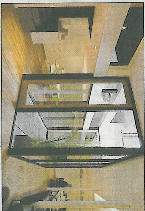
Judges said the Moore Street Housing development, above, demonstrated that social housing remained a vital focus for innovation in Scotland while, clockwise from right, The Printworks, Potterrow and the Beaton Institute's new cancer research facility were all commended by Royal Institute of British Architect Judges